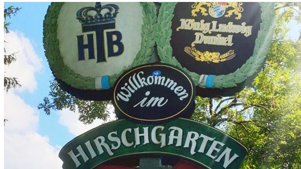
Sign at Hirschgarten

You are an international researcher and want to get to know your peers? The Welcome Services teams of TUM Graduate School and the TUM Global & Alumni Office invite all international researchers to join us for an informal get-together in the Hirschgarten beer garden that is one of Munich's most popular beer gardens. The Welcome Services of the TUM Global & Alumni Office will sponsor a couple of Bavarian cuisine platters. In traditional Bavarian beer gardens, you can bring your own food. We therefore kindly ask you to bring a favorite dish/ snack from your home country to turn our get-together into an international buffet. Please note that you will have to pay for your beverages!