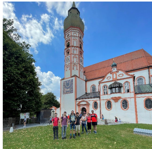
Impression from last's year hike

Welcome@TUM-GS is an event program especially created for new doctoral candidates who started their doctorate during the last 12 months and want to meet in a leisurely setting to explore TUM, Munich and its surroundings. Come join us On July 15 th for our recurring hike to Kloster Andechs, the lovely monastery situated on top of a small hill between lake Starnberg and Ammersee in the south of Munich. Get to see the breathtaking Bavarian landscape and get to taste all the Bavarian goodies the monastery has to offer once we reached its welcoming „Biergarten“. Let's enjoy the beer, the food and the view. Don't forget to take your swimsuit with you! The hike is suitable for beginners and will be mainly in the shade (as we will hike through a forest). Register now via email .