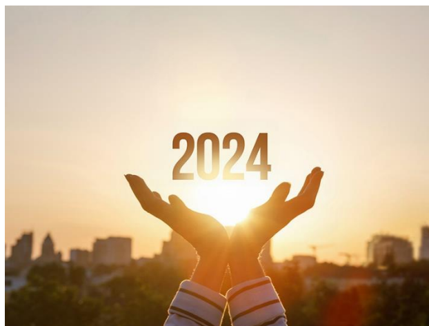
Hands holding 2024 phrase in the sun