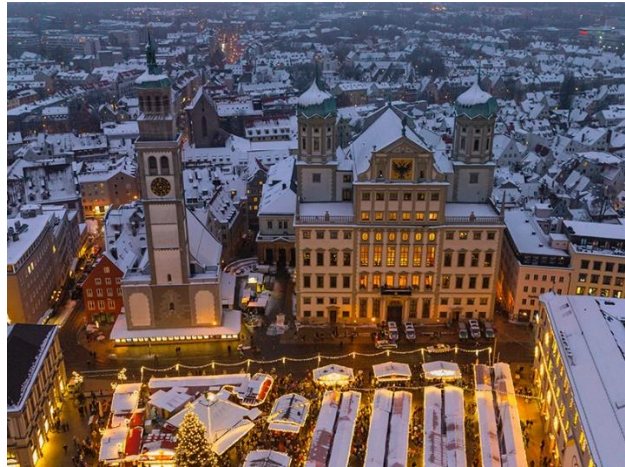
Christmas Market Augsburg

Have a look at our other Welcome@TUM-GS events in January and February 2025, too, and save your spot as soon as possible.