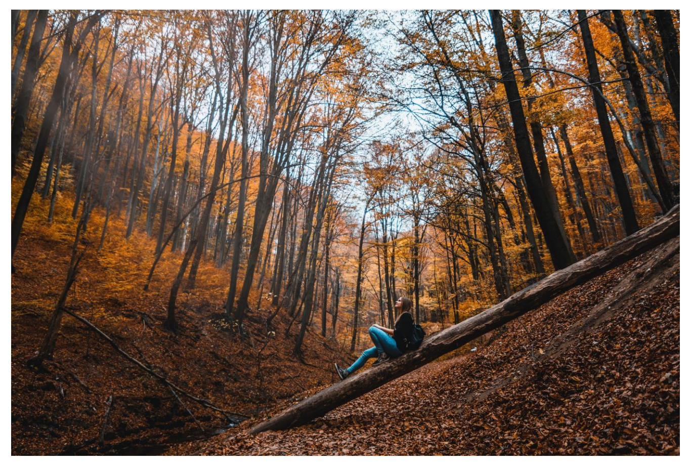
Woman sitting on a trunk in the middle of the woods