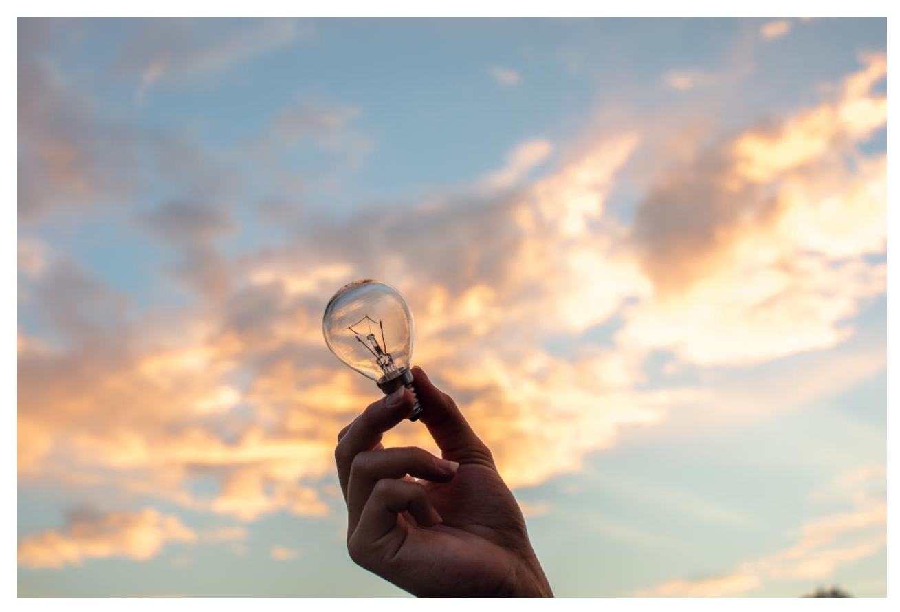
A hand holding a light bulb with the sky in the background